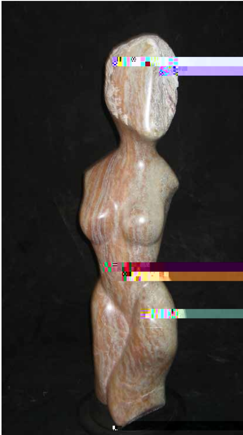
A Beautiful Mind , 2014, alabaster, 29" x 9"