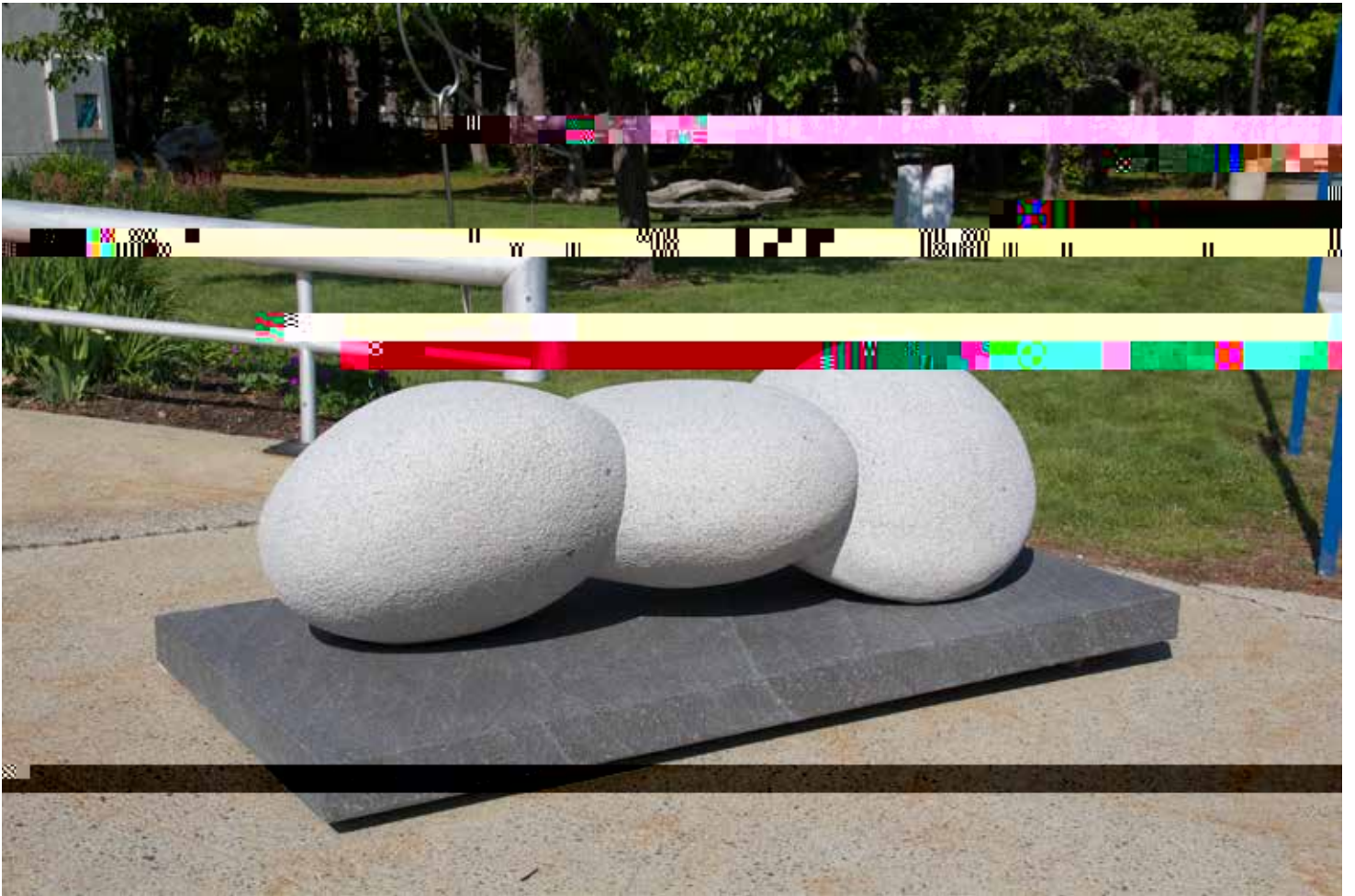
Composition Trio , 2015, granite, 4' x 8' x 3'